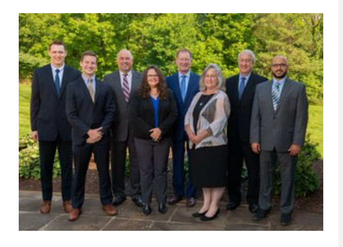
HFS Wealth Advisors