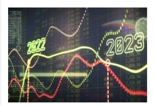
Surveying the Investor Landscape for 2023